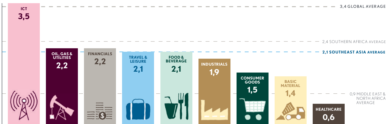
INDUSTRY AVERAGE SCORES

“We need to work together to ensure that we make children’s rights integral to how we do business, up to the board level and throughout the supply chain.”