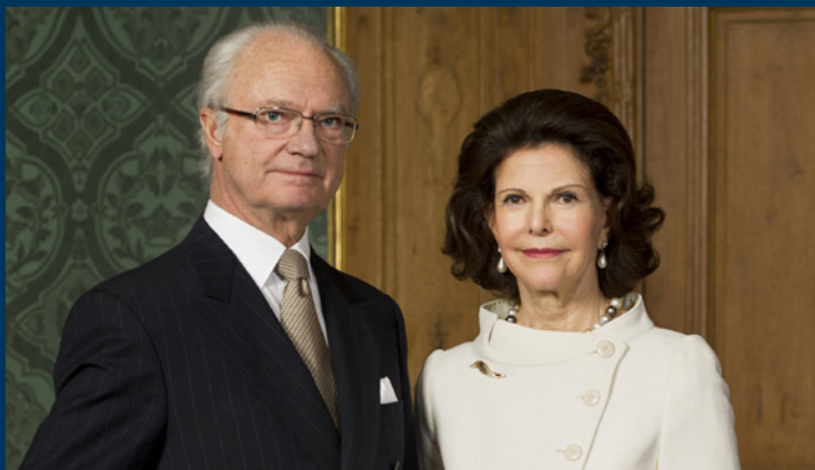
H.M. KING CARL XVI GUSTAF AND H.M. QUEEN SILVIA OF SWEDEN