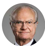
HM THE KING OF SWEDEN HONORARY CHAIR AND CO-FOUNDER