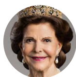
HM THE QUEEN OF SWEDEN CO-FOUNDER